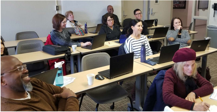
The Guided Pathways mapping process has begun, starting with the Biology Department February 22.