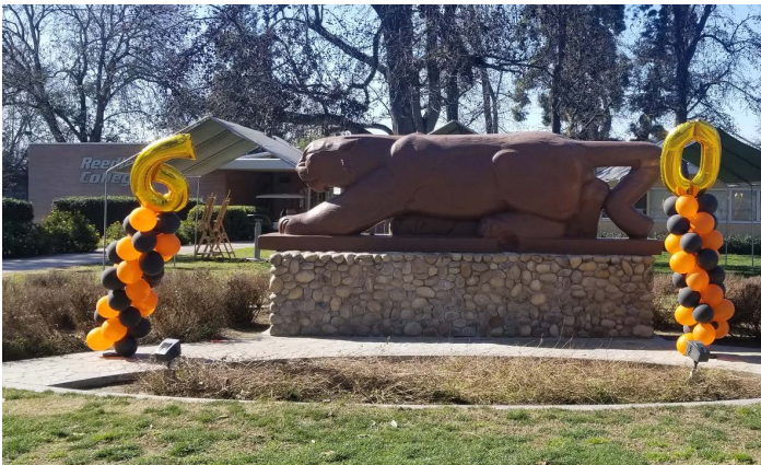
Clyde has been standing guard at RC for 60 years.