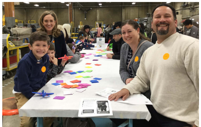
Parents and kids made airplanes as part of the activities in the Aero Building.

Our aeronautics department was thrilled to have the opportunity to host Valley PBS for an event for their Family Circle members February 9. Much thanks to our staff and student volunteers for being incredible hosts for a day of education about airplanes. PBS has a new show called "Let's Go Luna," featuring different cultures and traveling the world. Parents and their kids got to sit inside of some of our aircraft, play with our flight simulators and learn about aviation. They also watched an episode of the show.